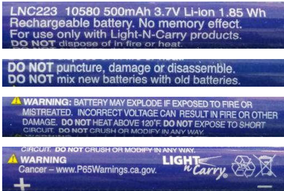
电池组铭牌 View of the battery nameplate