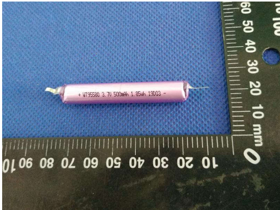
元件电池 View of the component cell