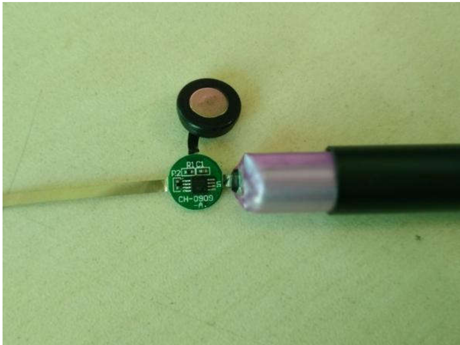
电池组结构 View of the battery structure