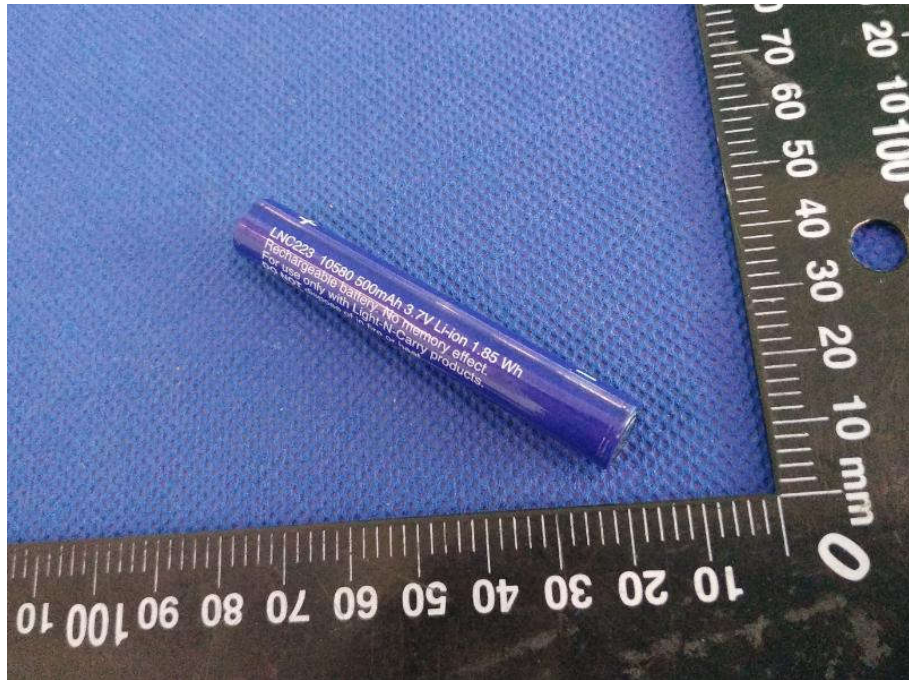
电池组外观 1 View of the battery 1