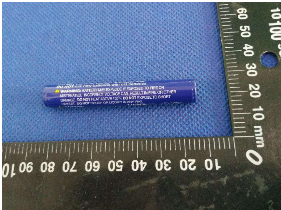
电池组外观 2 View of the battery 2