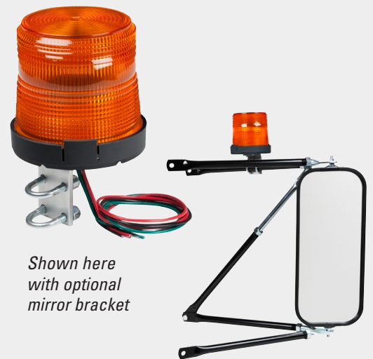
Shown here with optional mirror bracket

FOR MORE INFORMATION VISIT OUR WEBSITE AT GROTE.COM GROTE'S GOT IT!