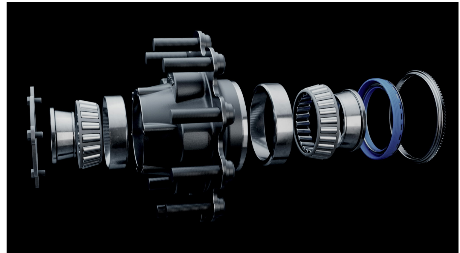
SKF Exploded hub with included retainer